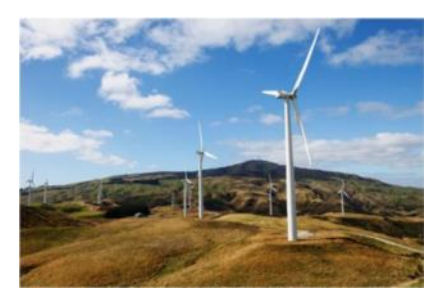
Energy and Sustainability